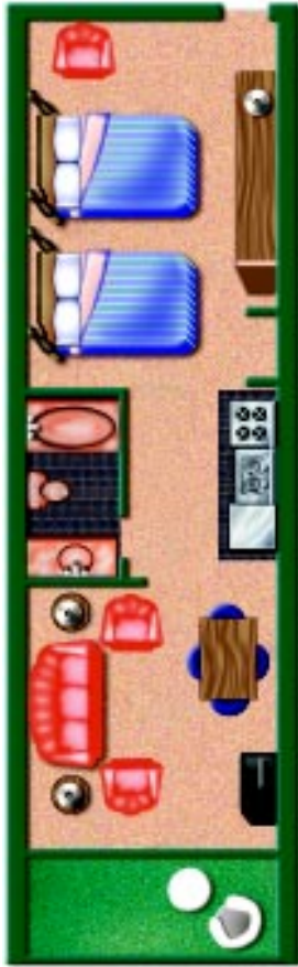
Style A Oceanfront 2-room Suite 2 double beds, 1 wall bed, sleeper sofa, 2 TVs, kitchen, microwave